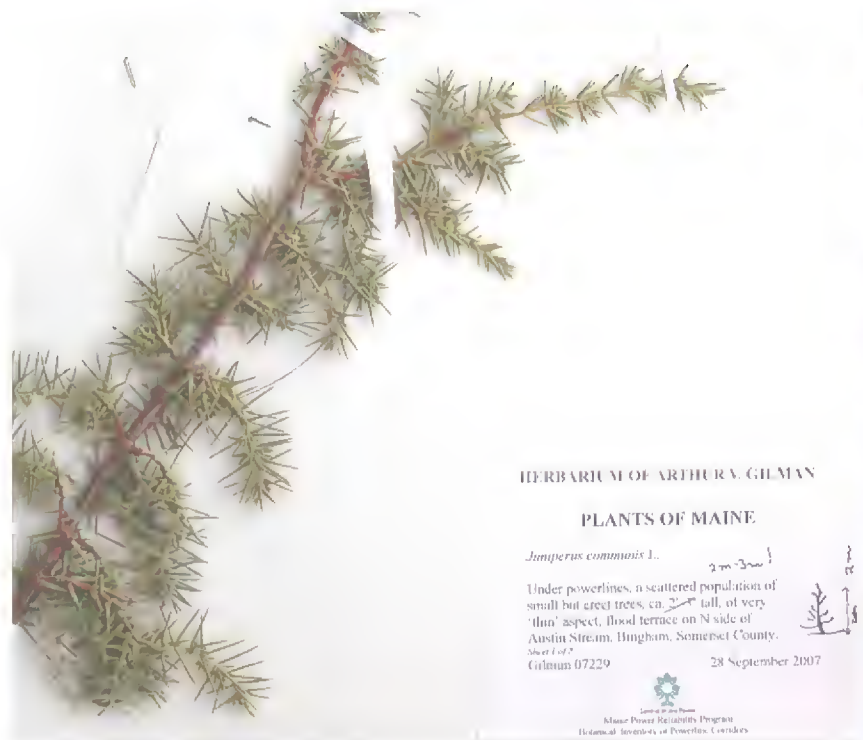
Fig. 7. var. communis , Bingham, ME